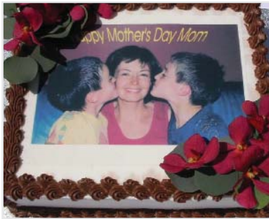
Photo is printed on edible rice paper with food colouring.